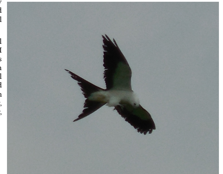
A swallow-tailed kite feeding.

While the STKI glides most of the time, the MIKI uses several wing strokes with short to long glides. By mid July, the STKI are heading south through mid-September and some as late as October. In the fall, large numbers of MIKI will head south through the coastal plains of Veracruz, Mexico with several hundred thousand birds recorded ( ebird.org/content/camerica/news/kite-migration ). In September, thousands are seen in Central America. Regretfully, the numbers counted in the US, were a little low this year, maybe we will have better numbers next year.