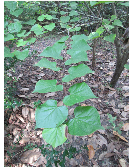
Eastern redbud is a common native tree.

Plantings within the woodland of native species such as Chickasaw plum, persimmon, redbud, crabapples, flowering dogwood, dwarf buckeye, American beautyberry, wax myrtle (yes, it's good for birds), native hollies, Viburnums, blueberries, and many other trees, shrubs, forbs, and grasses can enhance the aesthetics and wildlife productivity of any property. Proper juxtaposition