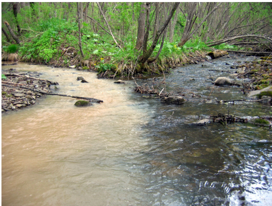
Sedimentation and water quality issues BMPs prevent.

A link to the current BMPs can be found here: http://www.state.sc.us/forest/bmpmanual.pdf