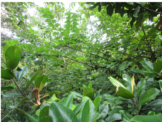
Eastern redbud and southern magnolia.

within the landscape is important and should be planned carefully.