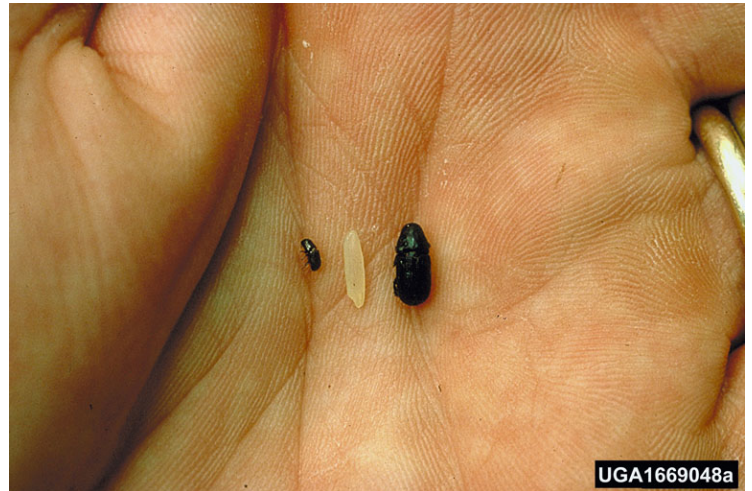
A southern pine beetle on the left, grain of rice in the middle and a black turpentine beetle on the right.