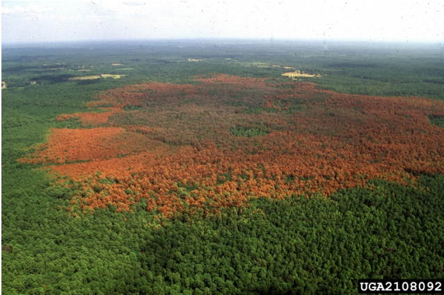
A pine stand with a southern pine beetle infestation