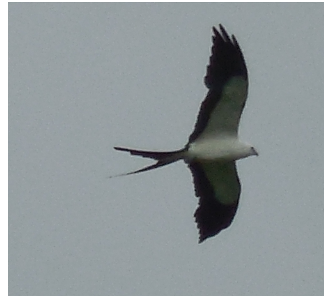
A swallow-tailed in flight.

A special thanks to the South Carolina Forestry Association. The majority of this information came from them and they are a strong voice in Columbia for the forest industry and landowners on these issues. More information on these issues and to join the SCFA: http://www.scforestry.org/legislation